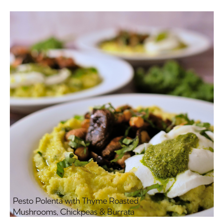
V - Vegetarian, VV - Vegan, GF - Gluten Free